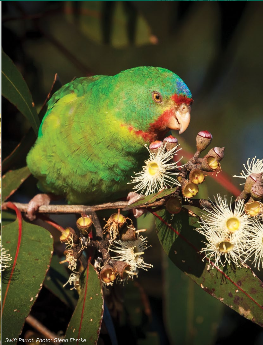
Swift Parrot.