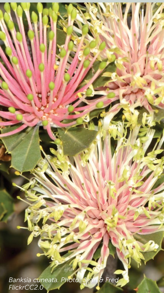
Banksia cuneata.

The web-app is being developed in collaboration with BirdLife Australia, the Terrestrial Ecosystem Research Network, UQ's Research Computing Center and the web-app developer Planticle.