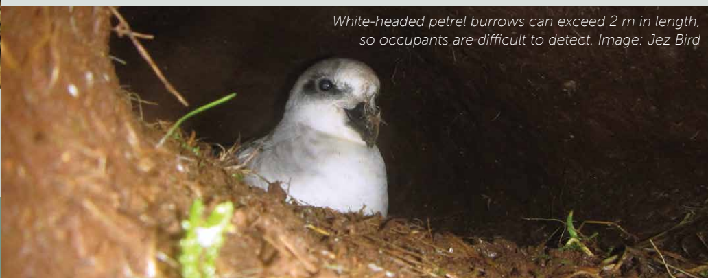
White-headed petrel burrows can exceed 2 m in length, so occupants are difficult to detect.

Currently, Tasmanian DPIW Parks and Wildlife rangers and government scientists spend time on the island surveying these birds, but they can be hard to detect. Burrowing petrels are particularly difficult to monitor due to their cryptic nature: birds only return to land at night, and only at certain times of year; different species can look incredibly similar; breeding sites can be fragile and hard to access; and the burrows are often so long it is difficult to identify the occupants.