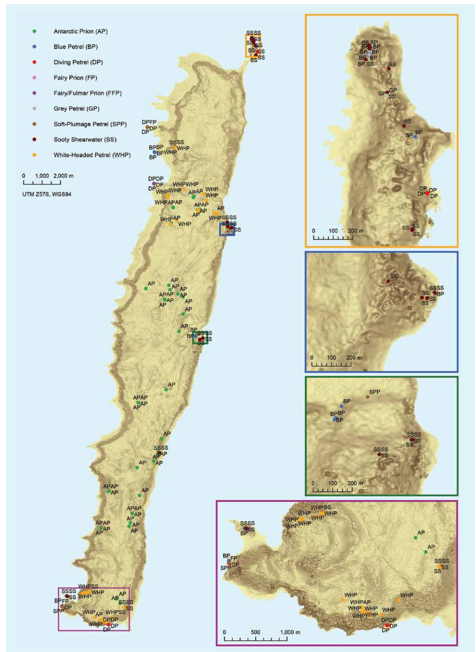
Figure 2. Sampling locations on Macquarie Island in 2017–18 where burrowing petrel species identification was confirmed using DNA from scats and feathers. NB: we couldn't distinguish between fulmar and fairy prion DNA in two samples.