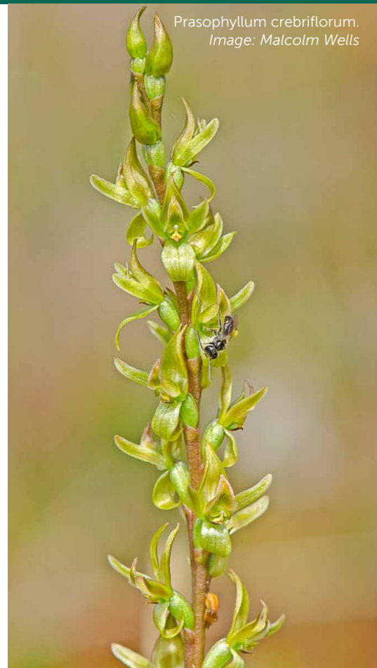
Prasophyllum crebriflorum .

The baseline year has an index value of 1. Changes in the index are proportional—a year with a TPX value of 0.5 indicates that on average the population size of each taxa has decreased to half the size they were during the baseline year; a TPX value of 1.5 indicates that on average population sizes are 50% above the baseline year.