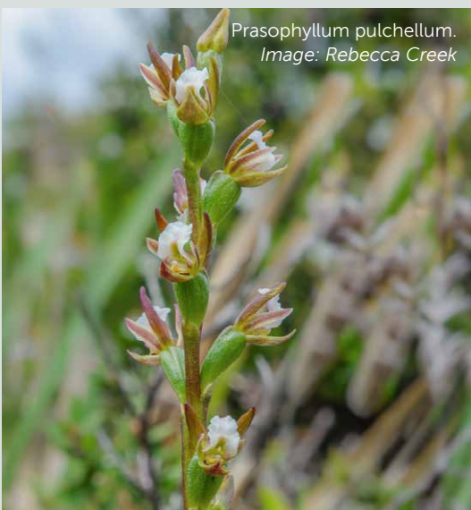
Prasophyllum pulchellum.

More data (and species) will be added to the index as they become available each year, increasing the representativeness and robustness of the findings.