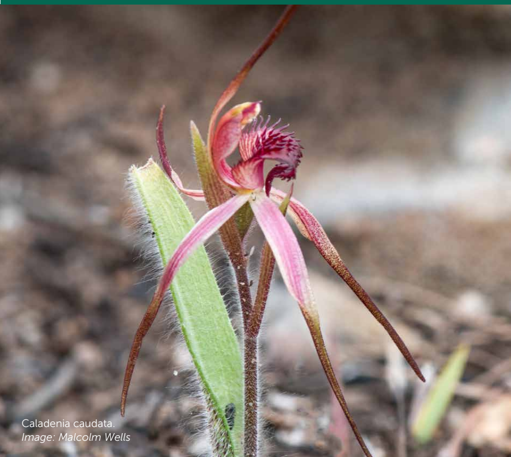
Caladenia caudata .

In this first iteration the Threatened Plant Index for Tasmania includes 4 taxa. You can find a summary of the species included by clicking "Data summary" on the TSX visualisation tool .