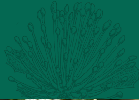
Phebalium daviesii .