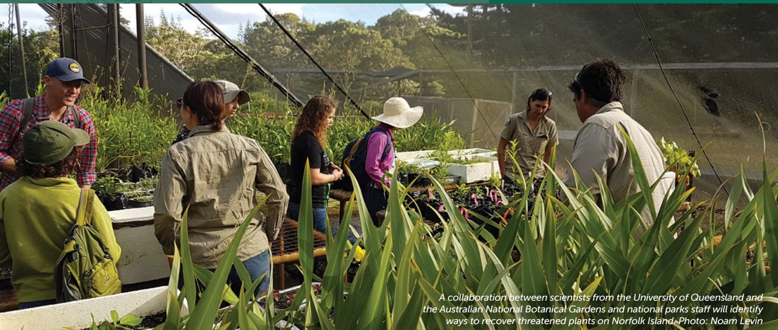
A collaboration between scientists from the University of Queensland and the Australian National Botanical Gardens and national parks staff will identify ways to recover threatened plants on Norfolk Island.

National Environmental Science Programme