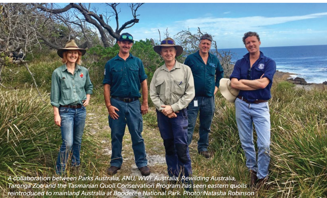
A collaboration between Parks Australia, ANU, WWF Australia, Rewilding Australia, Taronga Zoo and the Tasmanian Quoll Conservation Program has seen eastern quolls reintroduced to mainland Australia at Booderee National Park.

The project will run for one year from mid-2019 to mid-2020.