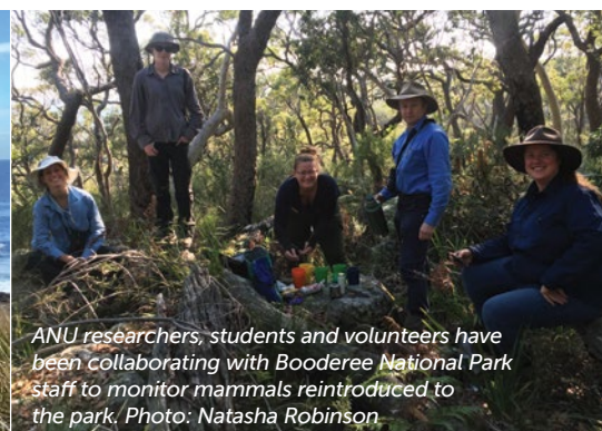
ANU researchers, students and volunteers have been collaborating with Booderee National Park staff to monitor mammals reintroduced to the park.