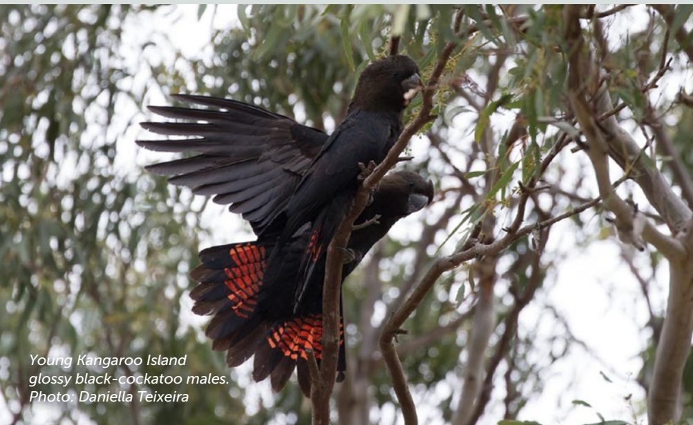
Young Kangaroo Island glossy black-cockatoo males.