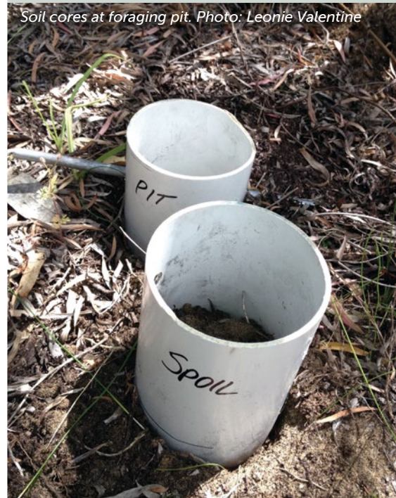
Soil cores at foraging pit.

Mycorrhizal mutualisms (the mutually beneficial relationship between a plant and mycorrhizal fungi) are also particularly important for plant growth. These fungi increase the ability of plants to take up phosphorous, nitrogen and micronutrients, and serve as a defence against plant pathogens. Colonisation by mycorrhizal fungi was greater in seedlings grown in the pit soil, where the least phosphorous was found.