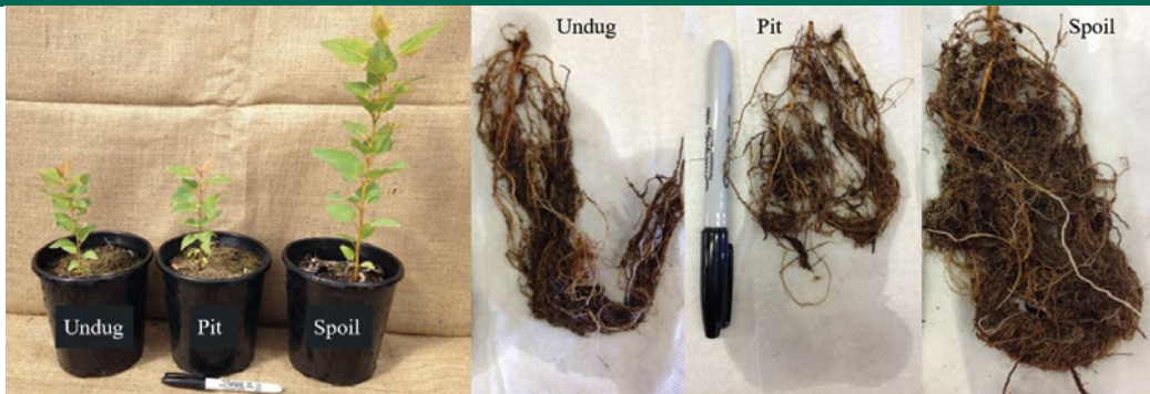
Tuart seedlings, and their root mass, after growing in undug soil, a quenda foraging pit and a quenda spoil heap.