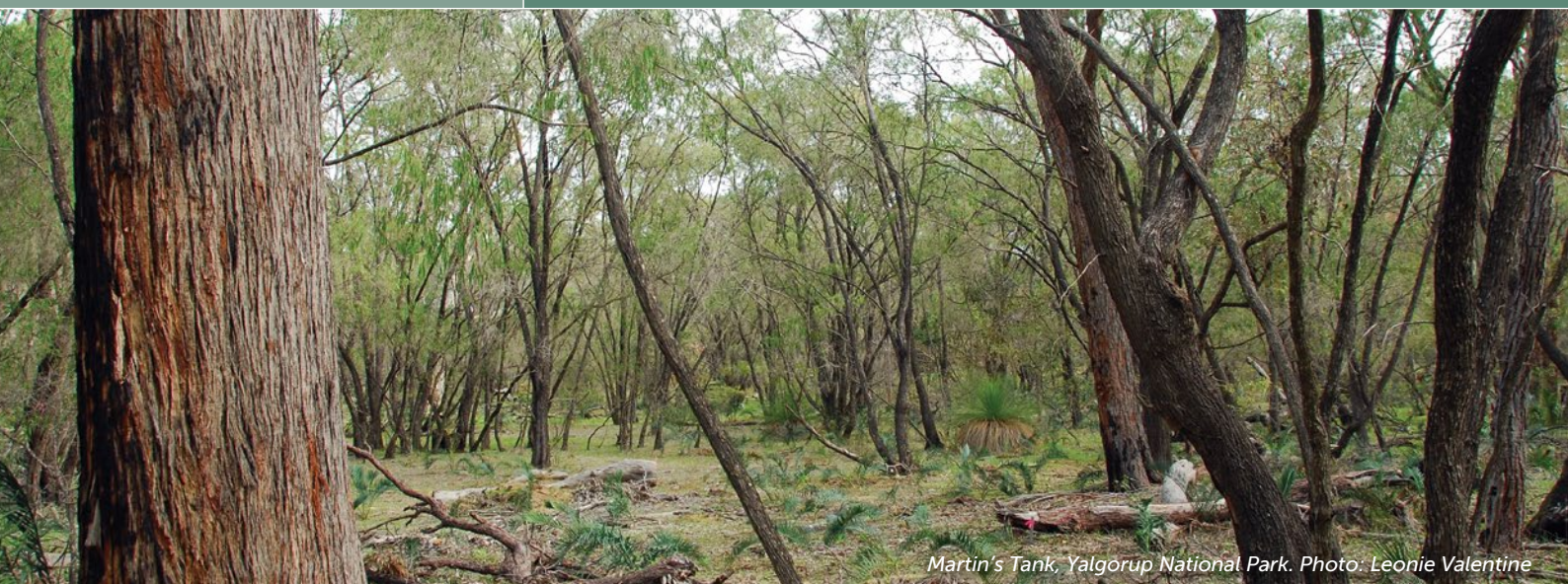
Martin's Tank, Yalgorup National Park.

Leonie Valentine - leonie.valentine@uwa.edu.au