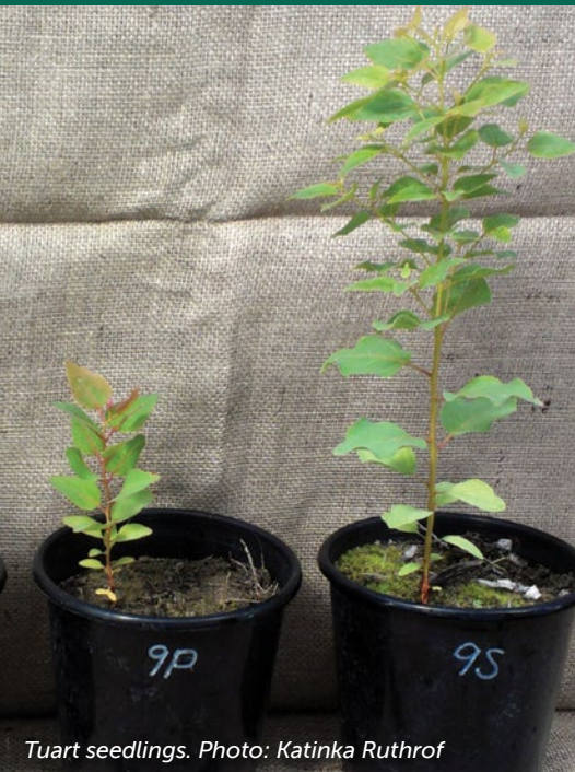
Tuart seedlings.