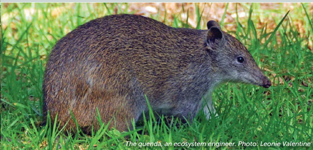
The quenda, an ecosystem engineer.

Quenda use their well-developed fore-limbs to dig for underground food such as invertebrates, fungi and tubers, creating foraging pits and associated conical-shaped mounds of discarded soil known as the spoil heap or ejecta mounds.