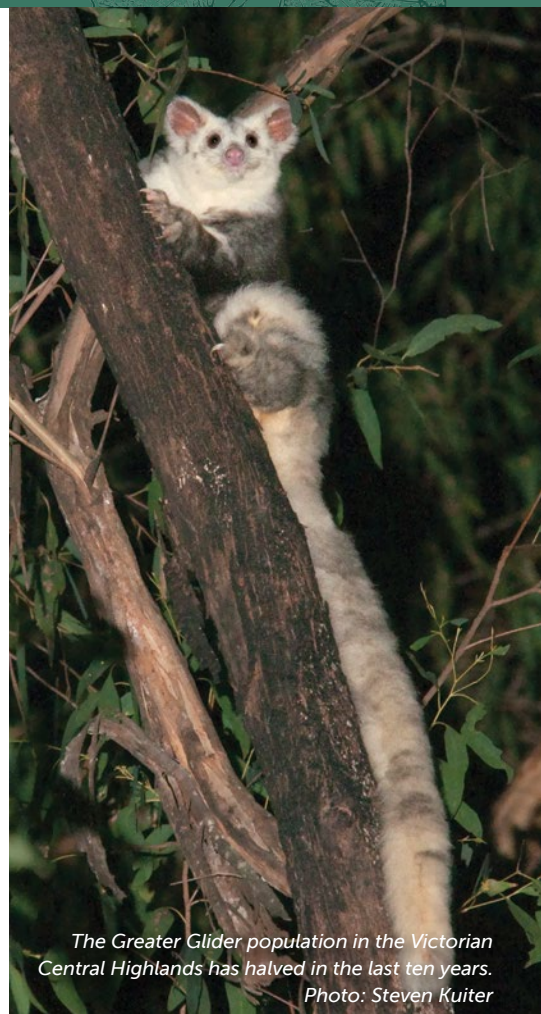
The Greater Glider population in the Victorian Central Highlands has halved in the last ten years.