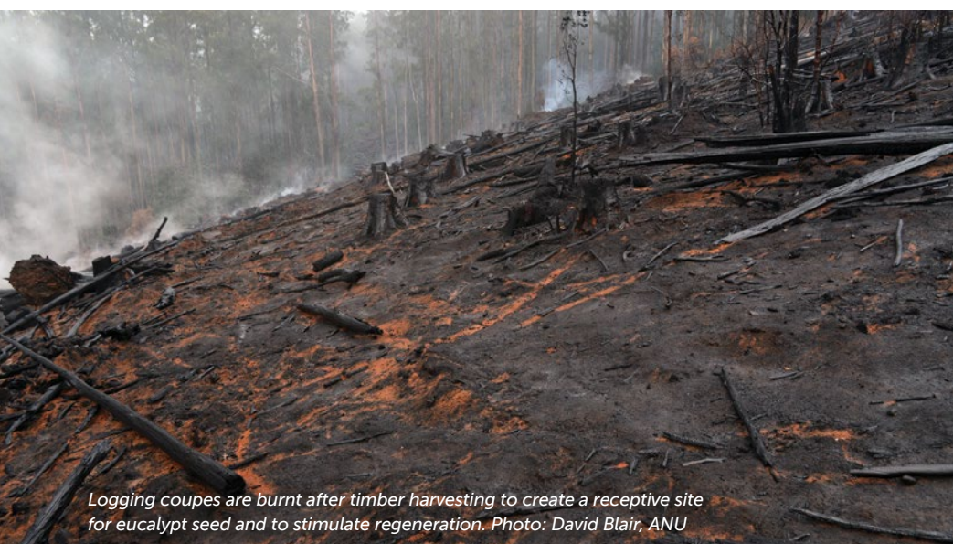
Logging coupes are burnt after timber harvesting to create a receptive site for eucalypt seed and to stimulate regeneration.