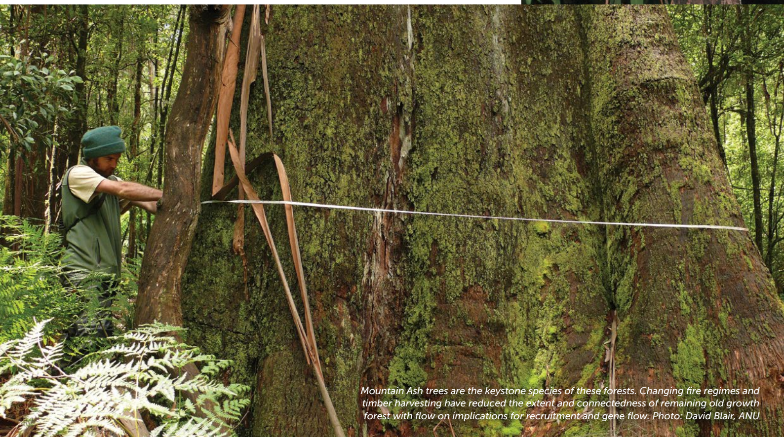
Mountain Ash trees are the keystone species of these forests. Changing fire regimes and timber harvesting have reduced the extent and connectedness of remaining old growth forest with flow on implications for recruitment and gene flow.