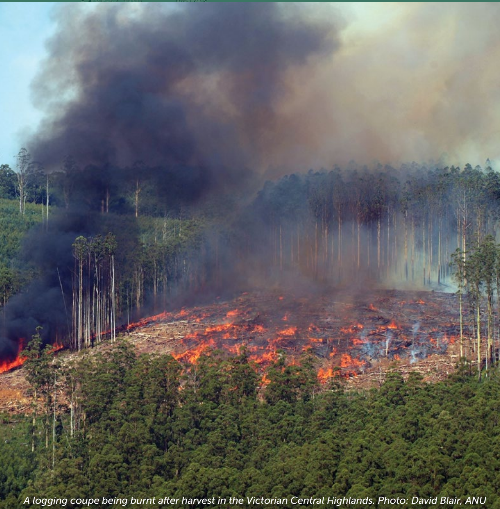
A logging coupe being burnt after harvest in the Victorian Central Highlands.

Existing forestry prescriptions do not provide adequate protection for these large old trees, resulting in the loss of many such trees. Research is needed to better understand the factors affecting den tree survival including interdependence with the surrounding understorey. The findings of this project will improve guidelines for buffer zone establishment to reduce the number of old trees which are being lost.