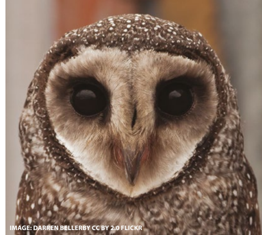
ABOVE: Greater sooty owls depend on tree hollows.

As climate change increases high fire-danger weather, losing forests to fire is an ongoing threat. What we can control is how much forest is disturbed by timber harvesting.