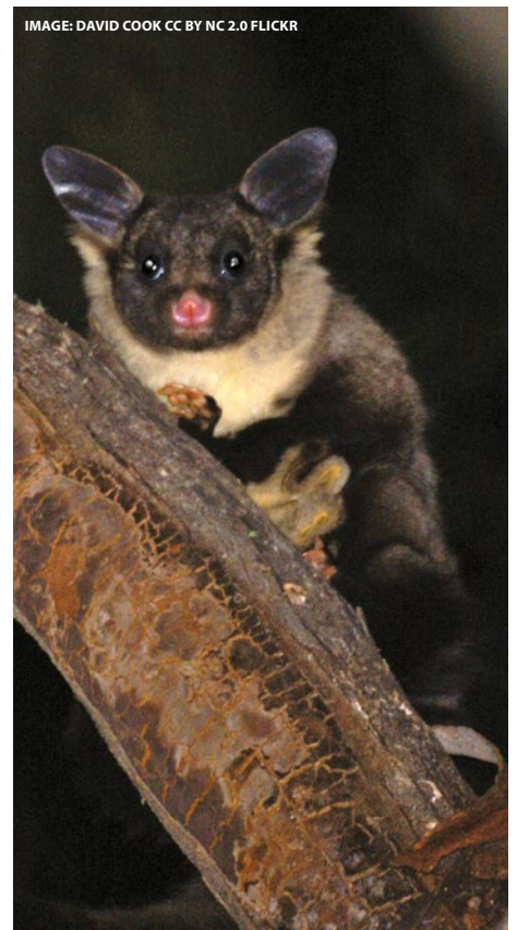
The main threats to the survival of yellow-bellied gliders are fire and logging.

Remaining forests are experiencing competing and sometimes conflicting demands – for water supply, tourism, biodiversity conservation and timber harvesting. How forests are used, especially with respect to logging, is decided under the Regional Forest Agreement, which is currently under negotiation.