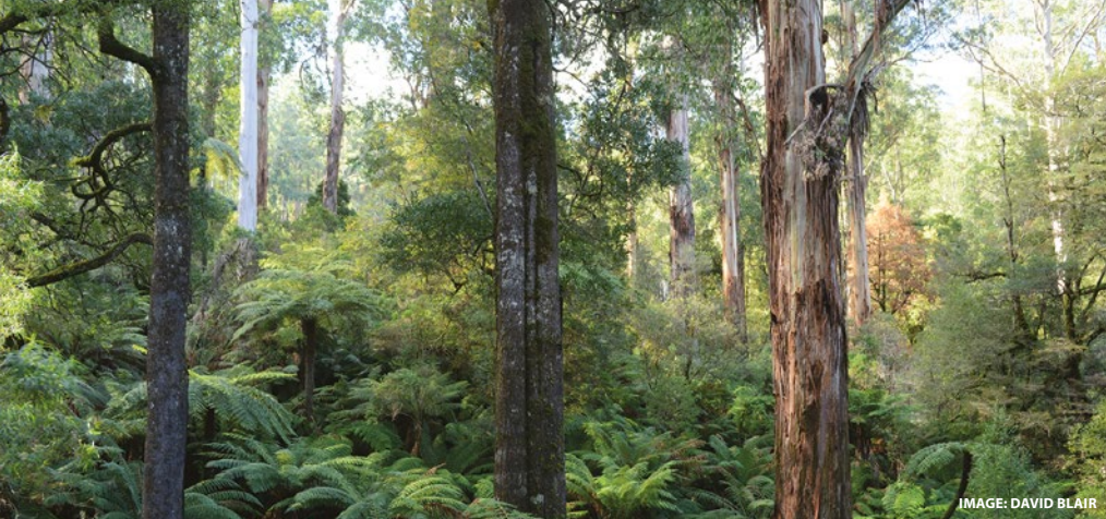
ABOVE: Old growth mountain ash forest in the O'Shannassy catchment.