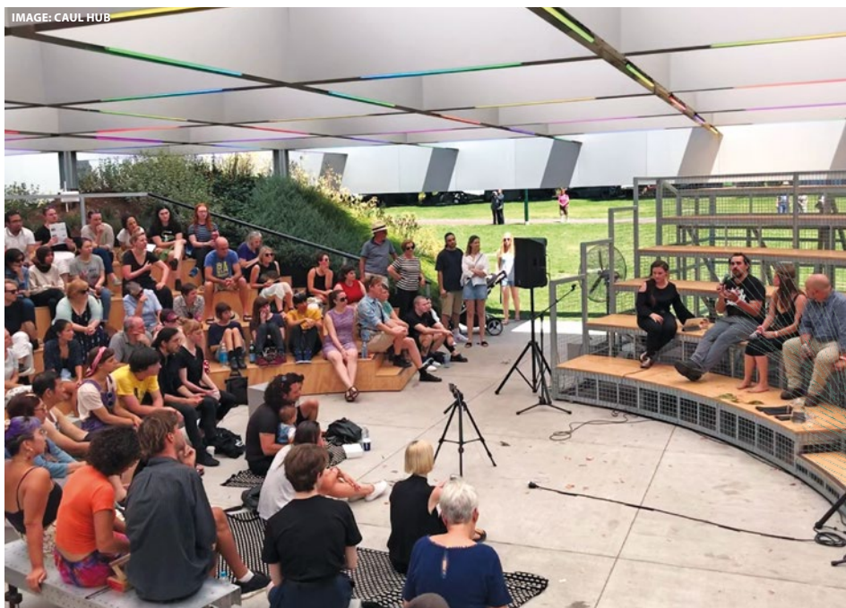
LEFT: Melbourne's MPavilion Indigenous knowledge and nature in our cities event.