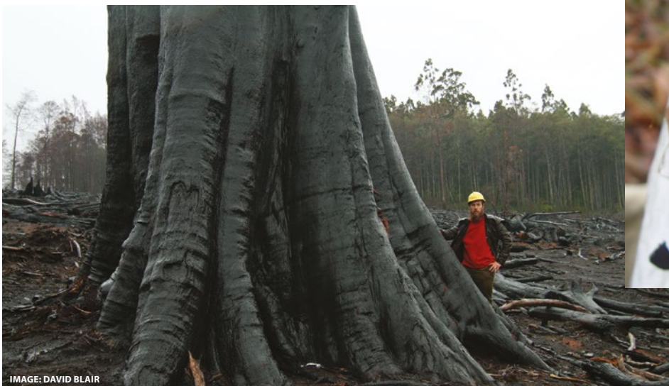
BELOW: Even when retained within logging coupes, large old trees can be killed by follow up regeneration burns.

For more information, please refer to the TSR Hub factsheet, "Implications of the rapid loss of large old hollow-bearing trees in Victorian Mountain Ash forests" www.nespthreatenedspecies.edu.au/publications-tools/factsheet-implications-of-the-rapid-loss-of-large-old-hollow-bearing-trees-in-victorian-mountain-ash