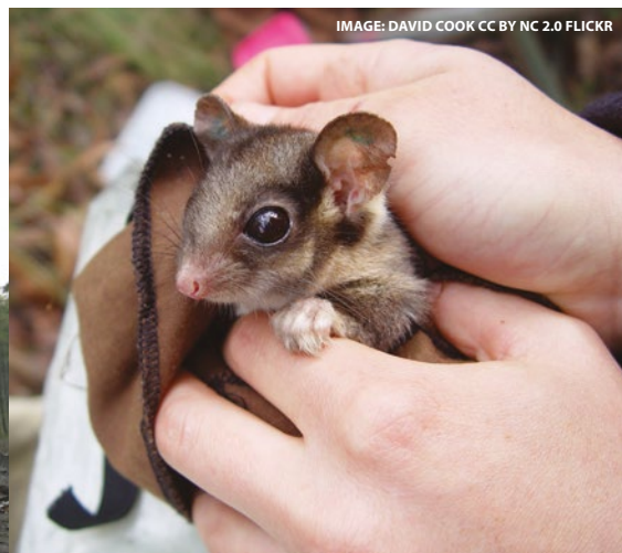
ABOVE: Leadbeater's possum is dependent on tree hollows and prefers hollows in very old trees.