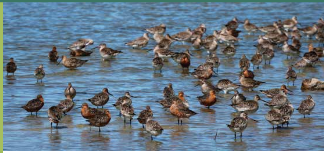
Roosting bar-tailed godwits.

It is endemic to the East Asian-Australasian Flyway and is heavily impacted by mudflat loss in the Yellow Sea region. Around three quarters of the population is thought to spend the non-breeding season in Australia, where it is also impacted by disturbance.