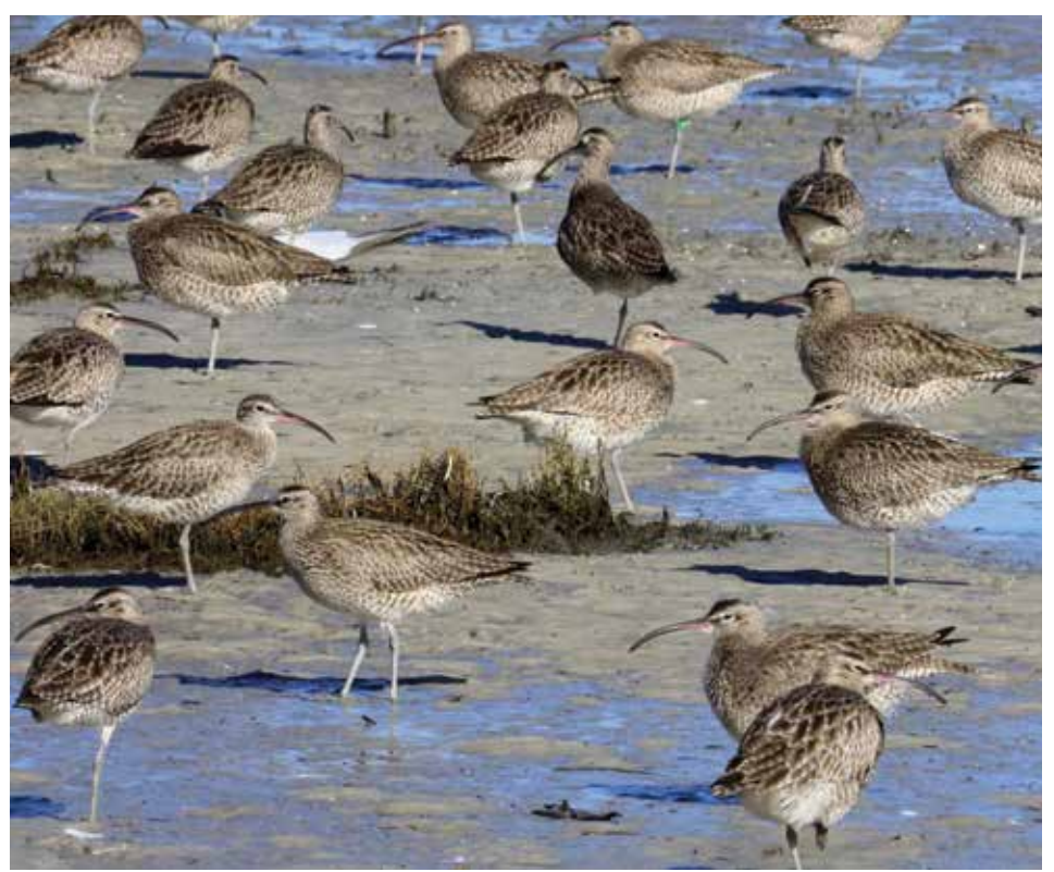
Roosting Whimbrel.

Variability in shorebird behaviour strongly indicates that managers wanting to improve roosting conditions for shorebirds of a given species in a given locality require a detailed local knowledge of available foraging and roosting habitat as well as the seasonal behaviour of target species for management. Similarly, design or implementation of artificial roosts requires careful consideration of regional and site-specific details and extensive consultation with relevant experts such as ecologists and engineers.