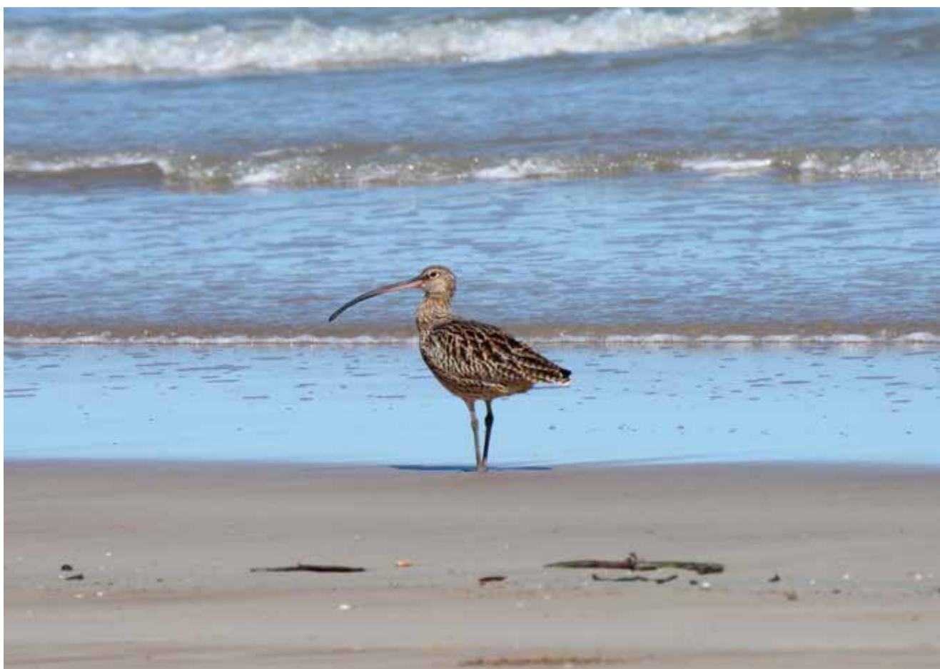
Far Eastern Curlew.

Table 3 provides a summary of Far Eastern Curlew counts on artificial habitats in Australia for which reports including count data could be identified. The two highest counts were both from port sites (Brisbane and Darwin), and the other count with over 100 individuals was from the Cheetham Saltfield. Five sites are associated with salt production, three with ports, and one with a constructed roost.