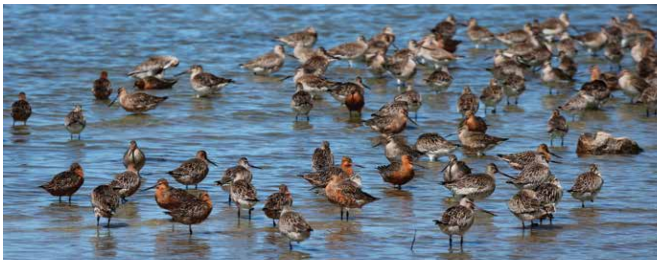
Bar-tailed Godwit roosting.

Approximately 150 articles were identified and reviewed using the above outlined methods. Of these approximately 80 were thought sufficiently relevant to be comprehensively read and included in this review.