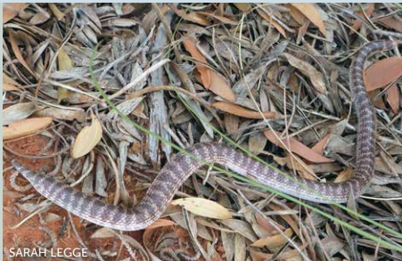
Northern shovel-nosed snake (Brachyurophis roperi) Pointed head and dark bands across body. Venomous but do not bite if kept calm.