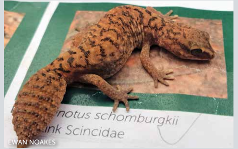
Desert fat-tailed gecko (Diplodactylus laevis) Fat tail and skinny fingers and toes with no toe pads.

Do not have eyelids, have long toes and padded fingers, soft skin.