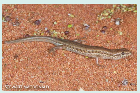
Ornate soil-crevice skink (Notoscincus ornatus) Big eyes, and coppery brown colour. Black side-stripe and sometimes dots on the back.