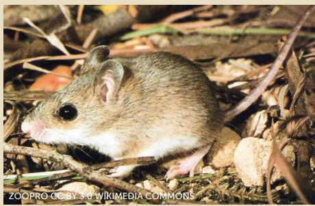
Delicate mouse (Pseudomys delicatulus) Smaller than a house mouse, has a long tail. Brown to orange-brown with white belly and cheeks. Nose, feet and tail are pink.