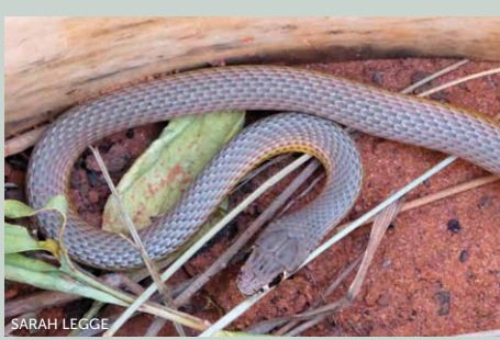
Narrow-headed whipsnake (Demansia angusticeps) Skinny, fast snake with white 'tear drop' and yellow along the side of body. Venomous but do not bite if kept calm.