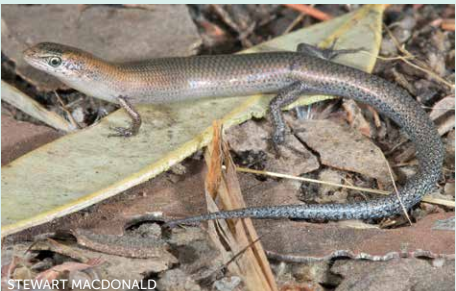
Northern soil-crevice skink ( Proablepharus tenuis ) Copper brown to olive-grey. Mature males are red on the sides of their head and neck.**