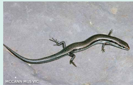
Common dwarf skink (Menetia greyii) Very small, has 4 fingers and 5 toes. Brownish grey to grey in colour with dark dashes on the back and a dark stripe running across either flank.