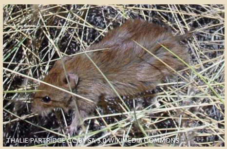
Desert mouse (Pseudomys desertor) Brown with light grey/brown belly, scaly tail and big eyes which have an orange ring. Has some long dark hairs which make the mouse seem spiny.