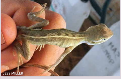
Pindan dragon (Diporiphora pindan) Thin, slender body. Two long white stripes down back that cross over black and orange tiger stripes.**