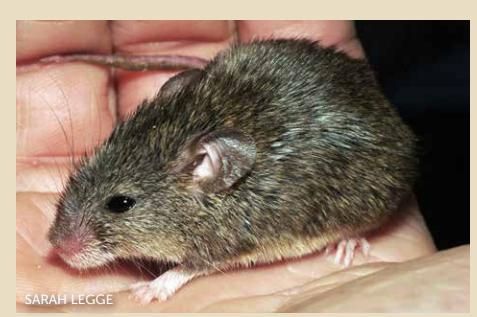
Northern short-tailed mouse (Leggadina lakedownensis) Grey-brown to grey with white belly and white feet. Tail is short (shorter than length of head and body).