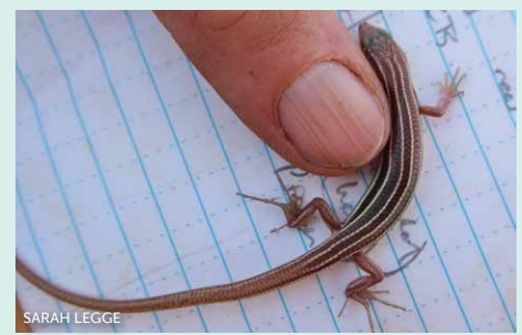
Coarse sands ctenotus (Ctenotus piankai) Reddish brown with 6–8 pale narrow stripes running down the back.**