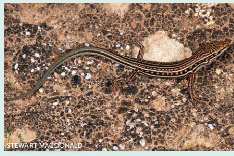
Barred wedgesnout ctenotus (Ctenotus schomburgkii) Olive to orange-brown with black stripes running down the centre of the back and two white stripes on either side. Has pale spots/blotches on the flanks.*