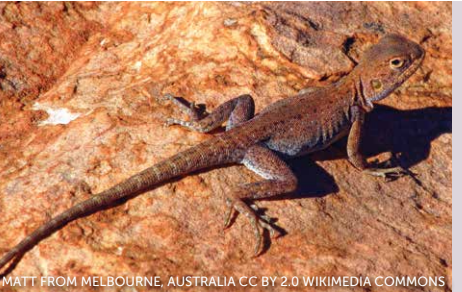
Slater's ring-tailed dragon (Ctenophorus slaterii) Rocky country. Reddish colour with black spots on back and dark rings on the tail.

Upright posture (stick their heads up), have small, rough scales, each leg has 5 clawed fingers/toes.