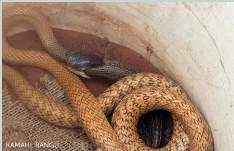
Gwardar (Pseudonaja mengdeni) Fast, slender snake with big eye and variable pattern. Can be orange body with black head, or brown with stripes. Dangerously venomous..