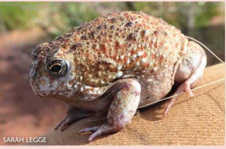
Desert spadefoot (Notaden nichollsi) Burrowing frog. Body is round and fat with many orange, red, brown, black and white spots and black patches on the back. No toe pads.