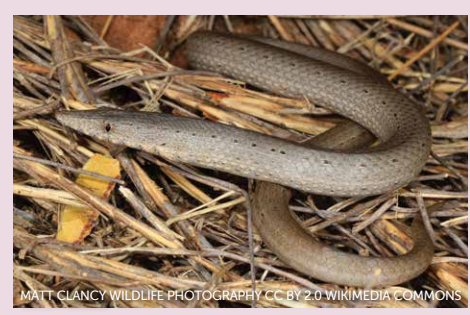
Burton's legless lizard ( Lialis burtonis ) Pencil lizard. Pointed, wedge-shaped nose and thin, slit-like pupils. Colour and pattern can vary.