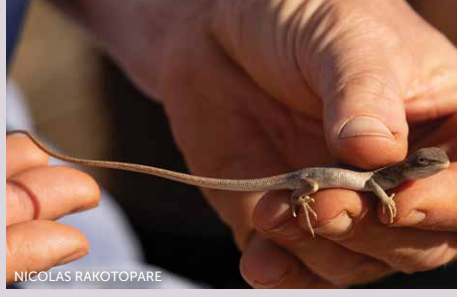
Northern Pilbara tree dragon (Diporiphora vescus) Lives in spinifex. Plain colour, sometimes with orange tail, and long white and grey stripes down body.*