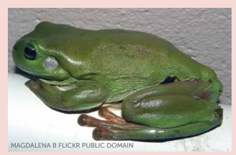
Green tree frog (Litoria caerulea) Large, plain green frog with obvious toe pads.