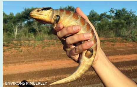
Centralian blue-tongued skink (Tiliqua multifasciata) Blue tongue with black stripe behind eye.