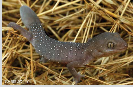
Jewelled gecko (Strophurus elderi) Brown or grey with tiny white spots which have a black border. Has a short, swollen tail.