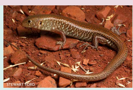
Giant desert/grand ctenotus (Ctenotus grandis) Big body. Reddish-brown with 5 narrow dark stripes running down the centre of the back and small pale dots on either side of the body and legs.