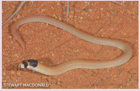
Western hooded scaly-foot ( Pygopus nigriceps ) Obvious flaps for back legs. Light brown body with pattern. Large black patch on back of head and black stripe through eyes.*