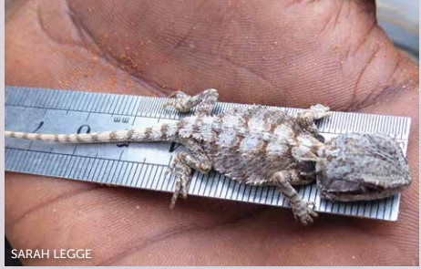
Dwarf bearded dragon (Pogona minor) Grey with flat body with spiny edges. Has small spines on either side of the jaw and on the back of the head.