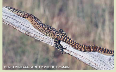
Ridge-tailed monitor (Varanus acanthurus) Spiny tail which has lighter rings. Many spots with dark centres all over body.