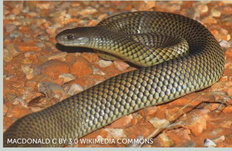
Mulga (king brown) snake (Pseudechis australis) Brown, scales have thin dark edges. Dangerously venomous.