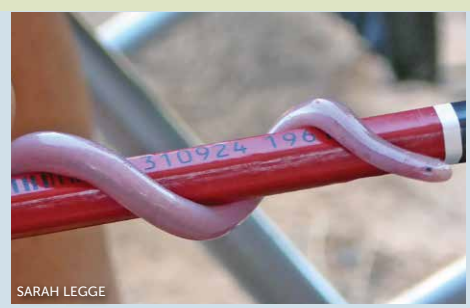
Northern blind snake (Anilios diversus) Pink body with rounded head.**

Worm-like snakes which burrow into the ground; head and tail are the same thickness.