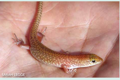
Mosaic desert skink (Eremiascincus musivus) Pale yellowish to orange-brown with a pale stripe running down the centre of the back from head to tail and spots all over the body forming a net-like pattern.