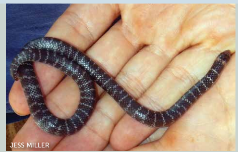
North-western shovel-nosed snake ( Brachyurophis approximans ) Pointed head. More greyish, and dark bands across body are more than 4 times as broad as the white bands. Venomous but do not bite if kept calm.