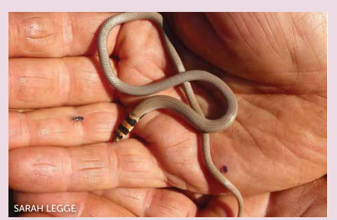
Desert delma (Delma desmosa) Brown with 3–4 dark bands on the head and neck.*