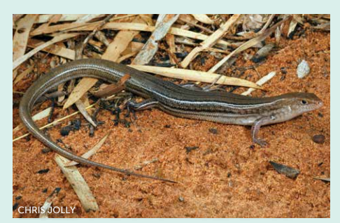
Rock ctenotus (Ctenotus saxatilis) Olive-brown to reddish-brown in colour with a white-bordered dark stripe running down the centre of the back.*