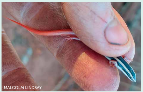
Lined fire-tailed skink (Morethia ruficauda) Five fingers and 5 toes. Black and white stripes down the side of the body. Tail is red.