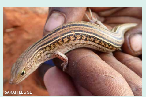
Bar-shouldered ctenotus (Ctenotus inornatus) Brown with 2 white stripes running down either side of the back.