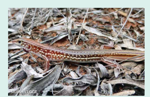
Spotted-necked ctenotus (Ctenotus greeri) Dark brown with white dots and dashes on either side of the body. Has a dark stripe with white edges running down the centre of the back and two white stripes on either side.*