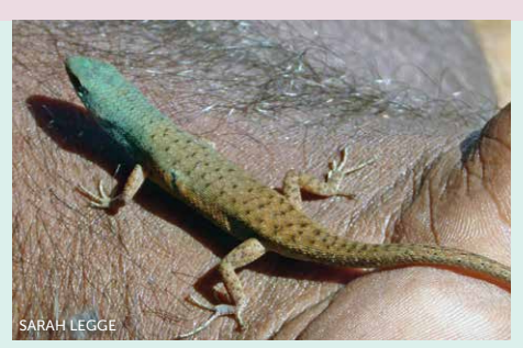
Desert rainbow-skink (Carlia triacantha) Greyish-brown with pale stripe under eye. Breeding male has a shiny green head and neck with reddish-brown flanks. Has 4 fingers and 5 toes.