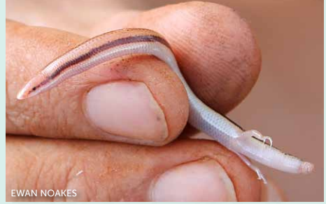
North-western sandslider ( Lerista bipes ) Pointed head. No front legs, back legs have 2 toes each.