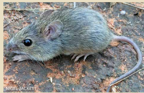
Sandy inland mouse (Pseudomys hermannsburgensis) Brown to grey-brown fur with white belly and cheeks. Looks very similar to the delicate mouse.