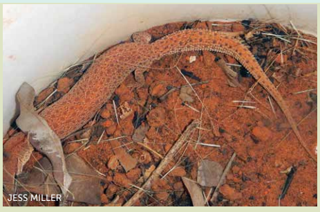
Pygmy short-tailed monitor (Varanus brevicauda) Small goanna with short tail and no stripes along tail.