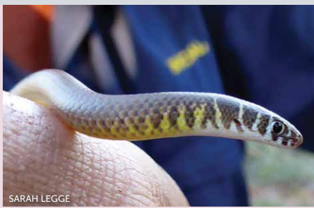
Unbanded delma (Delma butleri) Doesn't have strong pattern on top of head, but can have thin whitish bars on side of head. Fine dark edges to body scales.*