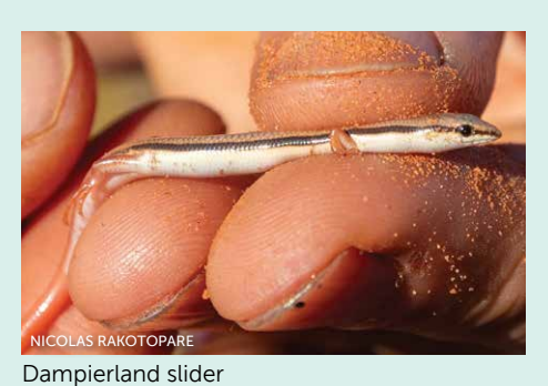
Has a dark stripe along the sides of the body. Orange tail. Has four legs with 4 fingers/toes each.