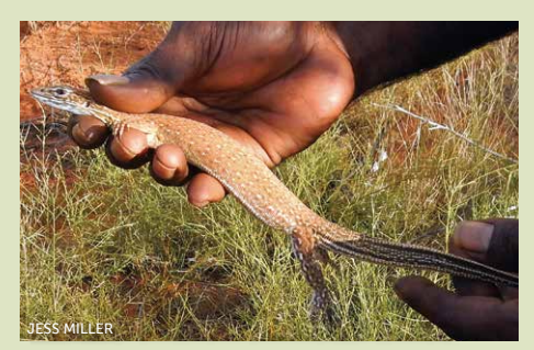
Pygmy desert monitor (Varanus eremius) Small goanna with reddish body and white stripes along tail.