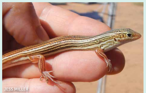
Fourteen-lined skink (Ctenotus quattuordecimlineatus) Reddish brown with 14 black or whitish stripes running down the back and tail.