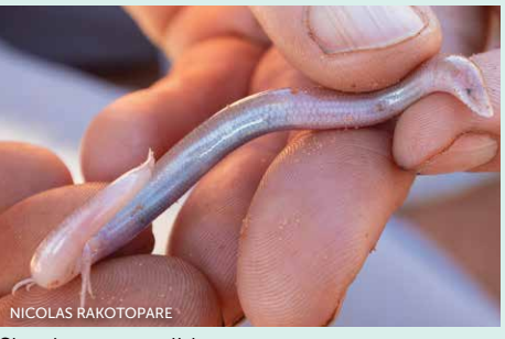
Slender worm-slider (Lerista vermicularis) Sand dunes. Thin with a flat, pointed nose. Pale yellowish brown to pinkish brown in colour. Has no front legs, back legs have 2 toes each.