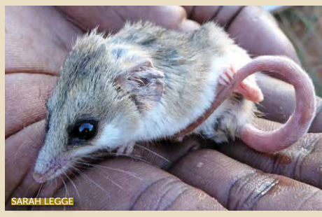
Lesser hairy-footed dunnart (Sminthopsis youngsoni) Small with a pointed nose, big black eyes, big ears, sharp teeth and broad, hairy feet. Brownish-yellow in colour above and white below. Base of tail is swollen.