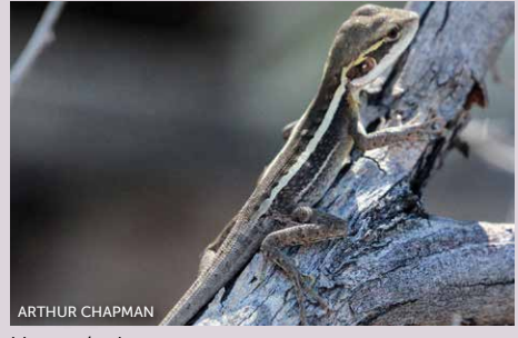
Horner's dragon (Lophognathus horneri) Ta-ta lizard. White stripe from lip to back legs. Tiny white spot in ear.