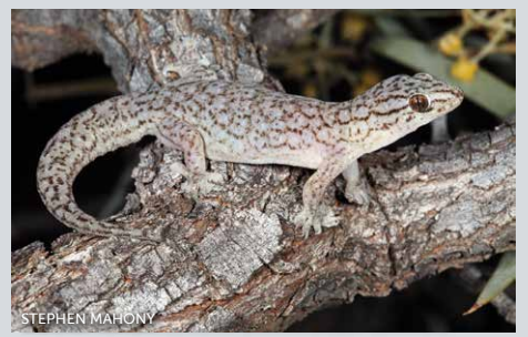
Purple dtella (Gehyra purpurescens): Pale purplish grey in colour with dark grey or brownish-grey spots or streaks which form a net-like pattern across the body. Toe pads for climbing.*