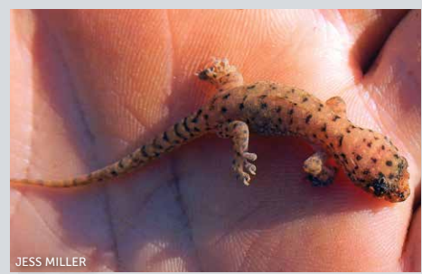
Robust termitaria gecko (Gehyra kimberleyi) Pale to dark brown in colour with alternating rows of dark and light spots. Has toe pads for climbing.*