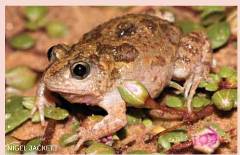
Mjoberg's toadlet (Uperoleia mjobergii) Very small burrowing frog. Pale brown or grey with darker patches and dark stripes across the back legs. No toe pads.