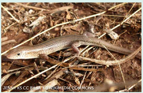
Clay-soil ctenotus (Ctenotus helenae) Olive brown to shiny greenish-brown with no pattern or with dark stripes running down the back.**