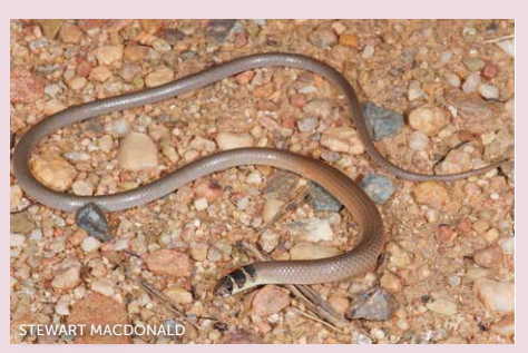
Black-necked delma (Delma tincta) Greyish-brown to reddish brown with 3–4 dark bands on head and neck in young lizards. Tail is nearly 4 times the length of the body.**