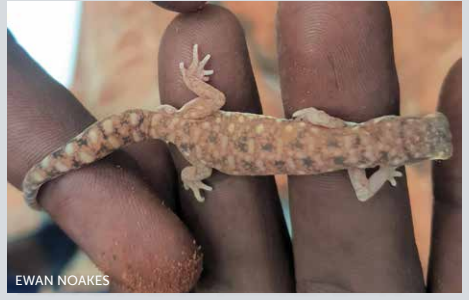
Western beaked gecko (Rhynchoedura ornata) Reddish brown with pale spots which have dark edges. Have dark markings or stripes on the back. Colour and pattern can vary. No toe pads.