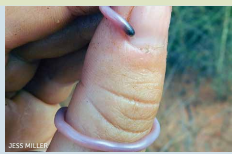
Long-beaked blind snake (Anilios grypus) Very skinny, pink body with black head and tail.*