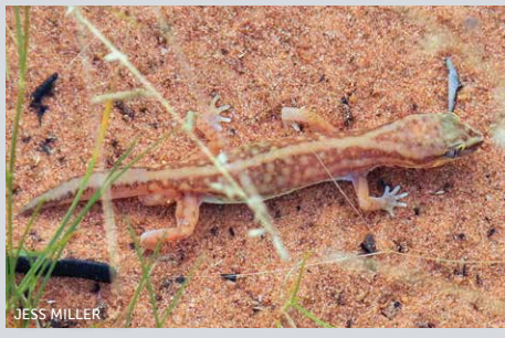
Sand-plain gecko (Lucasium stenodactylus) Pinkish to reddish-brown with white spots or a white stripe which branches to form a Y shape near the head. Colour and pattern can vary. No toe pads.