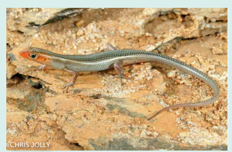
Western soil-crevice skink (Proablepharus reginae) Has a long tail and big eyes. Brown with dark-bordered scales forming a net-like pattern. Breeding males have red on the sides of their head and neck.**