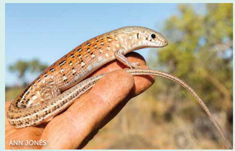
Leopard ctenotus (Ctenotus pantherinus) Copper brown to greenish-brown in colour with dark-bordered white/ pale spots.