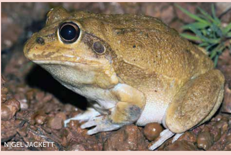
Giant frog (Cyclorana australis) Big brown or green frog similar to a cane toad. Large, dark ear disc. No toe pads.