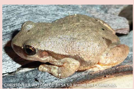
Desert/red tree frog (Litoria rubella) Light brown with a black stripe running along the side of its body starting from the tip of the nose. Has toe pads.