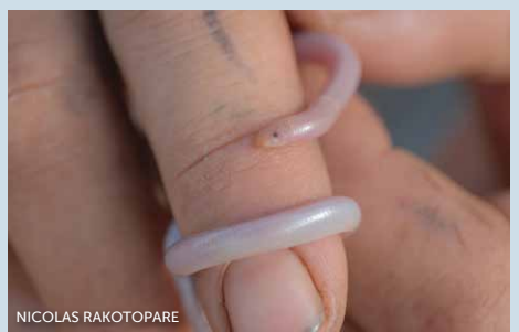
Interior blind snake (Anilios aff. endoterus) Medium sized, pale head with pointed snout.*