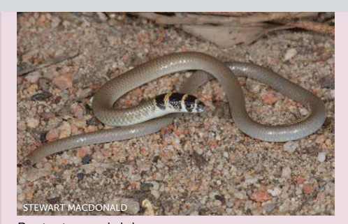
Rusty-topped delma (Delma borea) Brown to grey in colour with 3-4 black bands on the head which extend down on either side to the throat.*

No front legs, small flaps where the back legs would normally be, thick tongue (snakes have a thin, forked tongue) and obvious ear holes. Sometimes have re-grown tail, which a snake never has.