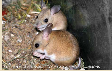
Spinifex hopping mouse (Notomys alexis) Big mouse with big ears and eyes. Hops on back legs. Very long tail with hairy tuft on the end.