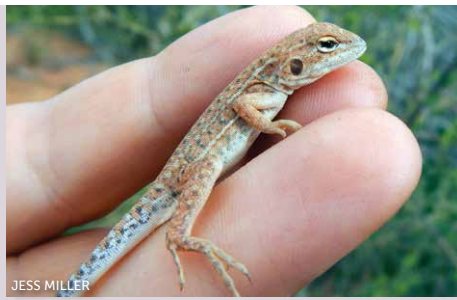
Central military dragon (Ctenophorus isolepis) Sandy country. Very fast on ground. Reddish colour with white spots and stripes.