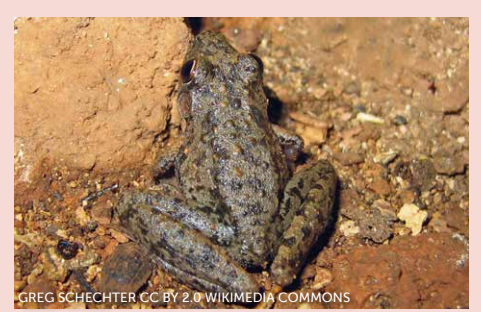
Bumpy rocket frog/Peter's frog (Litoria inermis) Lives in creeks and excellent jumper. Brown with bumps on back and yellow markings on legs. Has tiny toe pads.