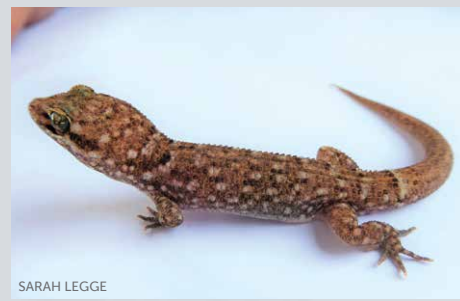
Bynoe's gecko (Heteronotia binoei) Covered with scales which look prickly but are soft when you touch them. Colour and pattern can vary greatly. No toe pads.