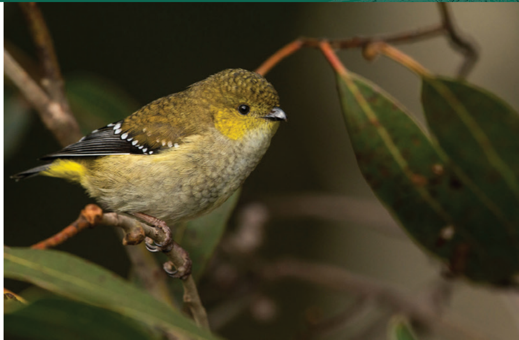
Forty-spotted pardalote.

The most suitable reintroduction sites are in white gum forest across the species' former range. In total these areas cover more than 1100 km 2 , about half of which occurs in patches of greater than 1 km 2 in area and which often form part of larger forest remnants.