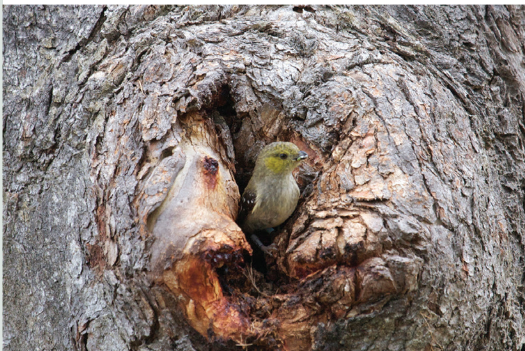
Forty-spotted pardalote in tree hollow.

To determine the population status of the forty-spotted pardalote, we conducted baseline surveys on the known refuges of Maria Island, North Bruny Island and Flinders Island, which together support almost 80% of the bird's current habitat area. We used occupancy modelling to estimate numbers in critical habitat for each refuge as well as in other locations with sparser data.