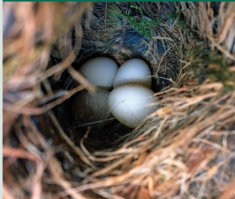
Forty-spotted pardalote nest.

The forty-spotted pardalote ( Pardalotus quadragintus ) is an Endangered bird endemic to Tasmania that is non-migratory and hard to detect due to its soft call, very small size and resemblance to two other more common pardalote species ( P. striatus and P. punctatus ).