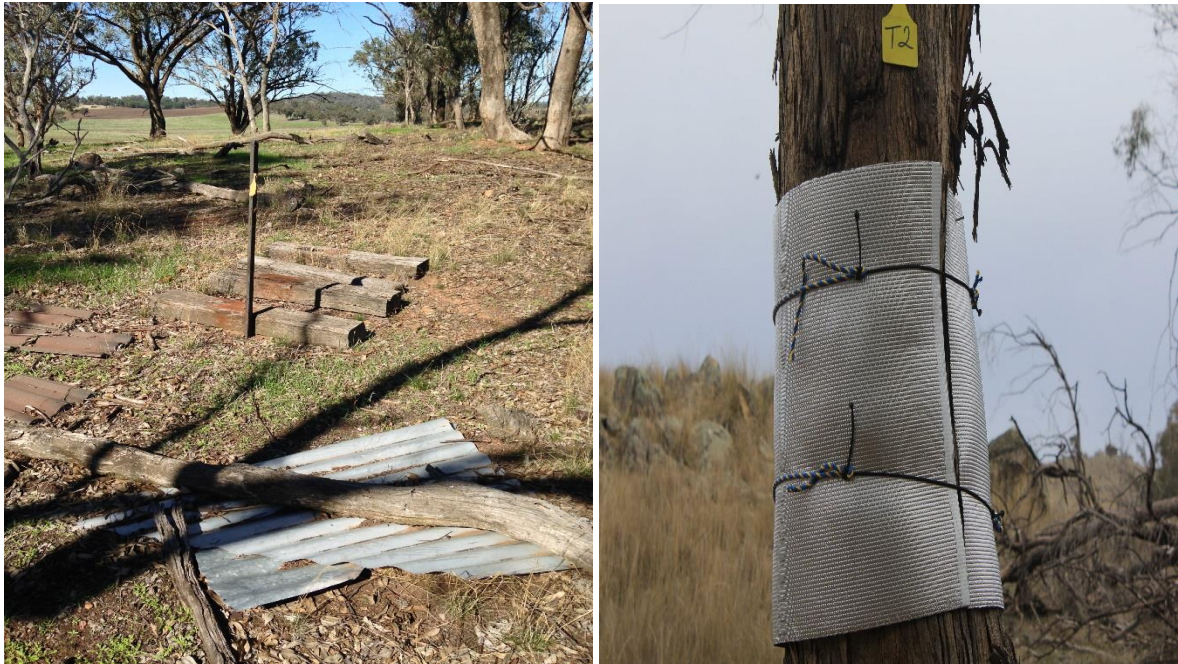
Figure 1. Terrestrial artificial refuges (left), double stack of corrugated steel, roofing tiles and timber railway sleepers. Foil-backed, closed-cell foam (right) used as an arboreal artificial bark refuge.