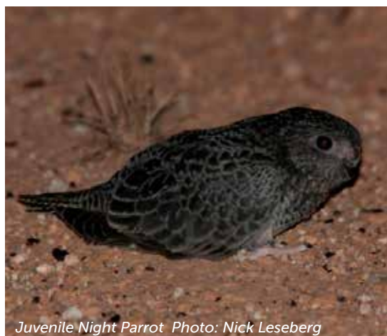
Juvenile Night Parrot

Initial research commenced in 2013, with this project starting in mid-2016 and continuing for the next three years.