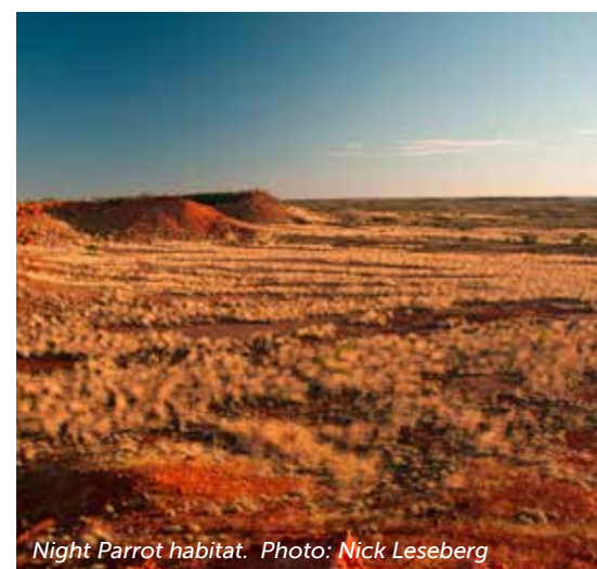
Night Parrot habitat.

However, such a secretive and nocturnal species is very difficult to study. Researching the Night Parrot is a painstaking process, with every piece of data very hard won, but we are slowly building a picture that will allow us to detect the bird more easily where it occurs, understand the habitat it requires, and understand how we can manage the landscape so it doesn't disappear for a second time.