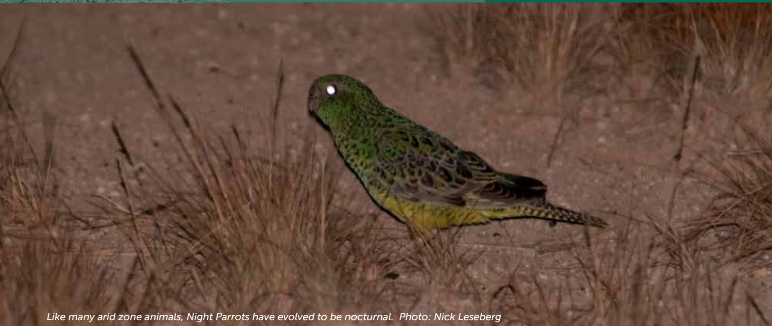
Like many arid zone animals, Night Parrots have evolved to be nocturnal.

National Environmental Science Programme